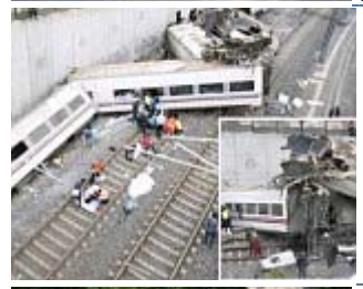
Pictured: Horrifying moment Spanish train derails killing at...