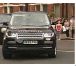
Baby George arrives at London's Kensington Palace