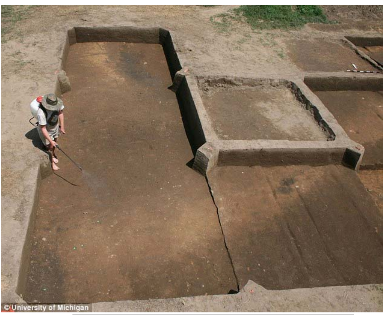
Intact: The corner bastion, moat and entryway are visible in this shot, taken from the south side of the fort