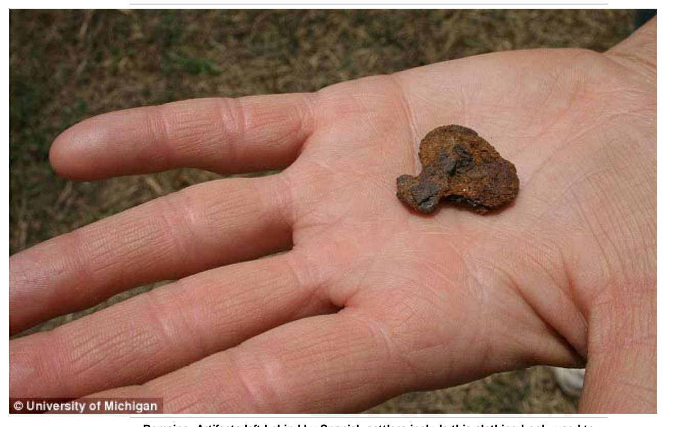
Remains: Artifacts left behind by Spanish settlers include this clothing hook, used to fasten doublets