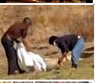
A haunting glimpse into the Tibetan sky burial