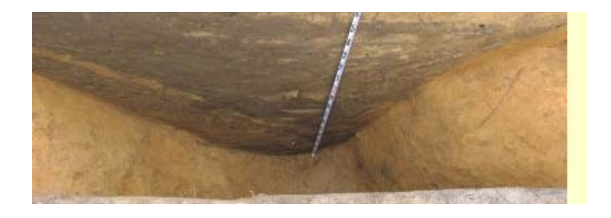
Pictured above: cross section of v-shaped trench Pictured below: Dr. Sarah Sherwood working to identify the stratigrapy of the trench feature