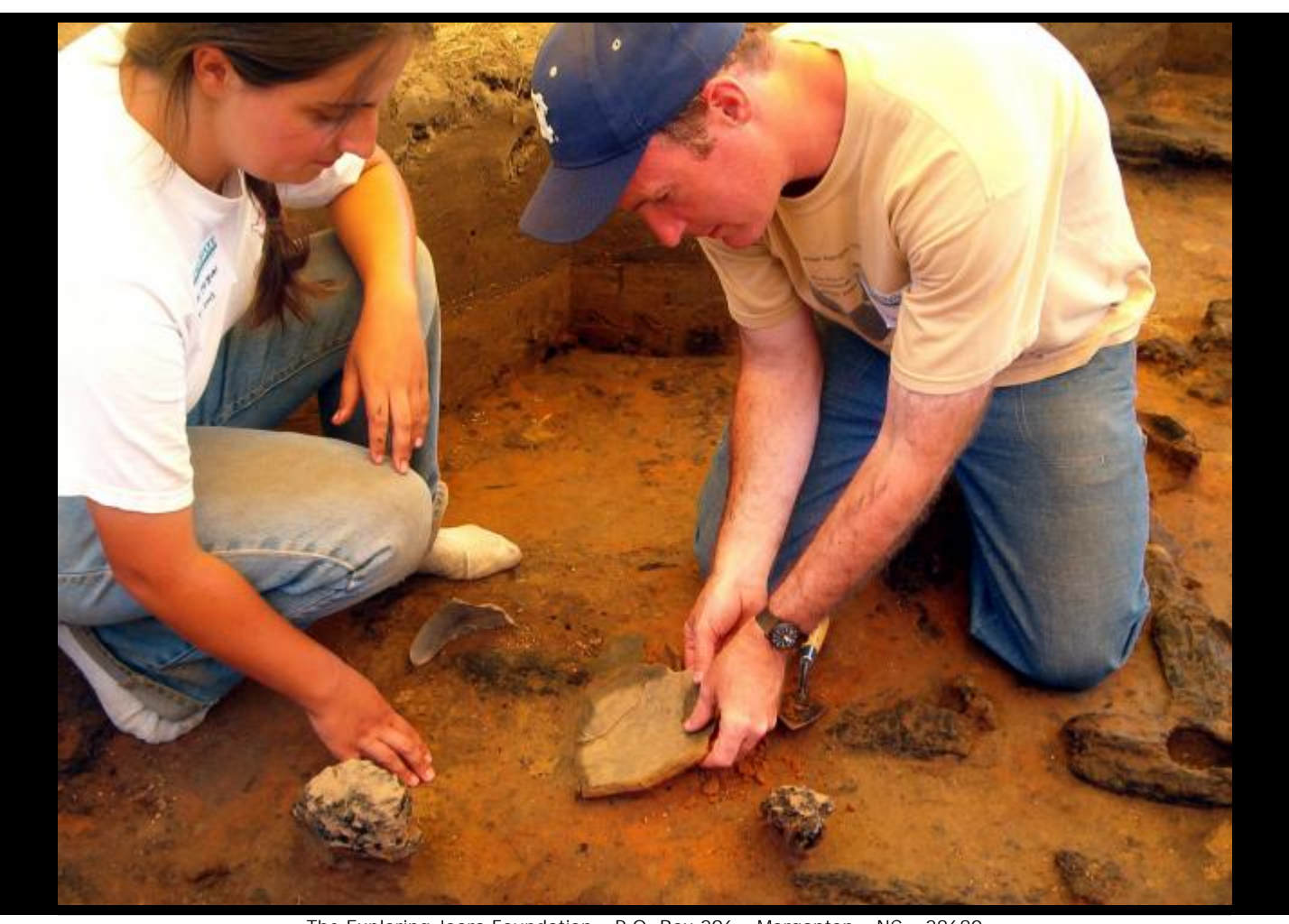
The Exploring Joara Foundation • P.O. Box 296 • Morganton • NC • 28680

<u>Subscribe</u> | <u>Unsubscribe</u> | <u>Preferences</u> | <u>Send to a Friend</u> | <u>Report Spam</u>