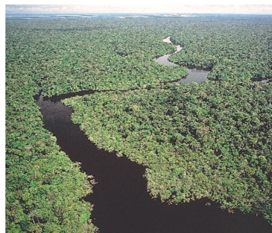
Figure 2 The central Amazonian rainforest. The conservation value of tropical forests includes providing habitat for about half of the world's biological diversity, maintaining existing hydrological cycles and providing chemical precursors for the biomedical industry, not to mention the aesthetic and intrinsic value of a vast natural wilderness. The trees can also act as an important sink for carbon, continuing to accumulate it in their wood for over a century after an increase in biomass productivity.

Avoiding deforestation will help industrialized countries to meet their Kyoto protocol emission-reduction obligations. Deforestation not only transfers carbon stocks directly to the atmosphere by combus-