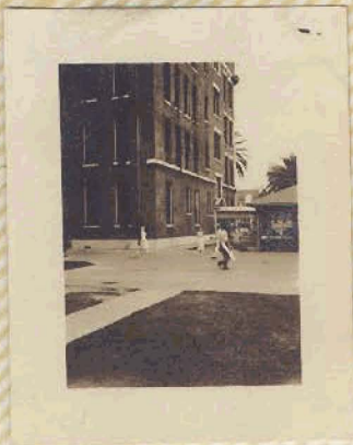
Delgado (Surgical Service)