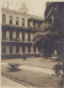
Colored Male Building