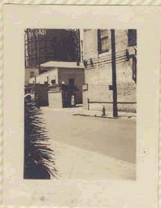
Taken from the side of the Hutchinson

side Gate of The Charity through which Ty Lane students would enter and exit.