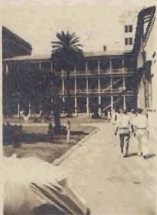
colored female building