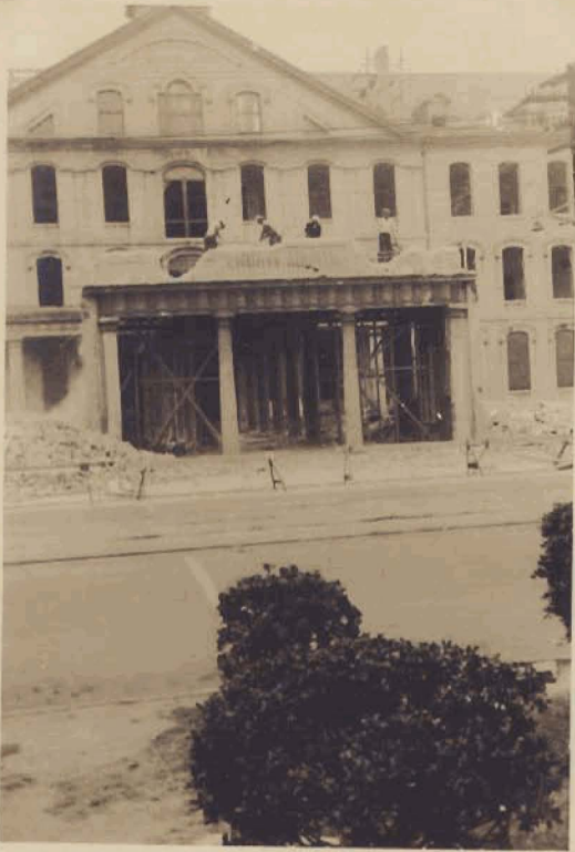
DEMOLITION BEGINS. MAIN ENTRANCE ARCADE, 1834 BUILDING, AND DELGADO AS SEEN FROM TULANE AVE.